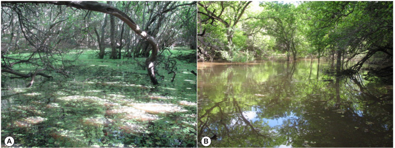
FIGURE 3. Habitats of A. vanderbergi in the Isoceño community of Kuaridenda. A) Temporary pond located in Kuaridenda. B) Another temporary pond located in Kuaridenda, approximately 100 meters from the pond depicted in Figure 3A..