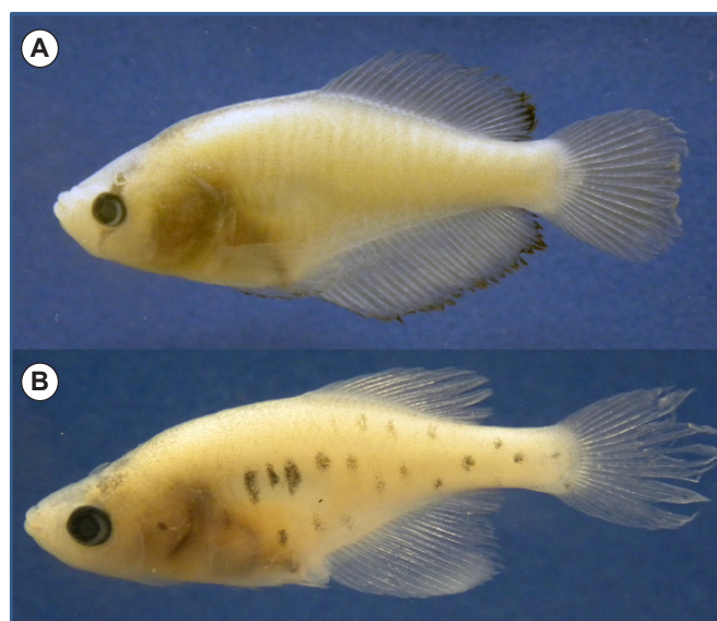
FIGURE 1. Austrolebias vandenbergi : A) male and B) female collected in temporary ponds near Kuaridenda.

Austrolebias , Costa (2006) examined only paratypes from Paraguay and Argentina. Individuals of A. vandenbergi were collected during a series of pond surveys in March and April 2011, in the Gran Chaco ecosystem, a flat, continuous semiarid tropical dry thorn forest of southeastern Bolivia. Specimens were collected using a modified pipe-sampler ( A = 1.3 \text{ m}^2 ; Skelly 1996) which was cleared with a dipnet (mesh size = 2 mm) and with time-constrained dipnet surveys. This new record was collected from two temporary forest ponds (mean pond length = 121.14 m; mean pond depth = 60.75 m; mean pond forest cover = 78%) near the Isoceño community of Kuaridenda (19.17336° S, 62.58801° W and 19.17630° S, 62.58920° W), Province Cordillera, Department of Santa Cruz, Bolivia (Figure 2). All individuals captured were immediately fixed in 10% formalin and later stored in 70% ethanol for final examination. Specimens collected and analyzed were deposited at the Texas Cooperative