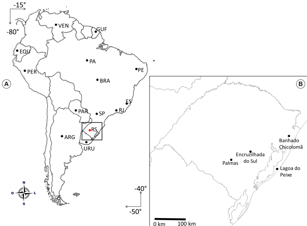
FIGURE 1. A) Previous known distribution (black spots) of Anax amazili and the current record (red spot); B) Detailed map of the occurrence of Anax amazili in wetlands of the state of Rio Grande do Sul, southern Brazil.

The new records of A. amazili in southern Brazil suggest that more detailed taxonomic efforts should be made to determine the Odonate diversity in the wetland systems of this region.