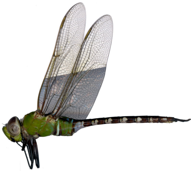
FIGURE 4. Mature live adult male of Anax amazili .