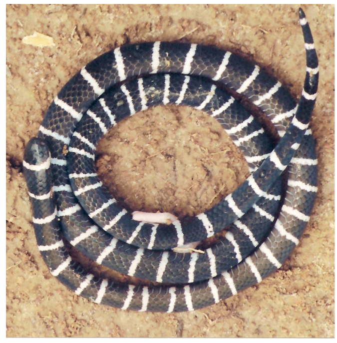
FIGURE 1. Preserved specimen of Micrurus annellatus annellatus (male UFAC 289; SVL = 400 mm, tail length = 73 mm) from Parque Nacional da Serra do Divisor, state of Acre, Brazil.

On 24 November 1996 one individual of Micrurus annellatus annellatus (Figure 1; Voucher specimen UFAC 289) was collected in the Serra do Divisor National Park (Rio Azul, Colocação Juazeiro; 07°33′ S, 73°16′ W, Datum = WGS 84, 230 m elevation; Figure 2), located in the northwest of state of Acre, in Upper Juruá region, Amazonia, Brazil. The specimen (total length = 473 mm; male) was found moving on the leaf litter at night (20:15 h) in primary forest. On 10 January 2012 another specimen (Figure 3; UFACF 4081; total length = 385 mm; female) was collected by local inhabitants in forest (agroforestry system) in the Extractive Reserve Chico Mendes in the municipality