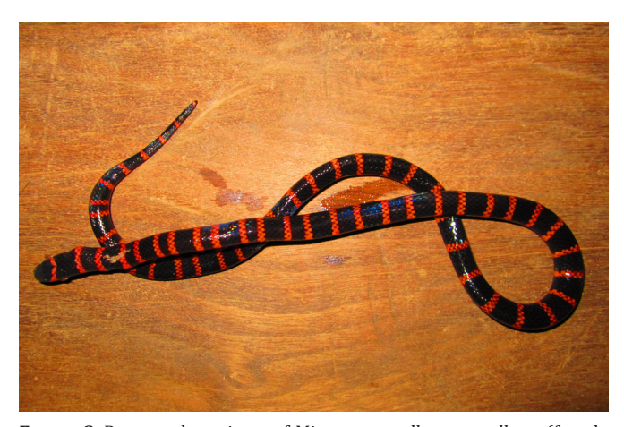
FIGURE 3. Preserved specimen of Micrurus annellatus annellatus (female UFACF 4081; SVL = 350 mm, tail length = 35 mm) from Extractive Reserve Chico Mendes, state of Acre, Brazil.