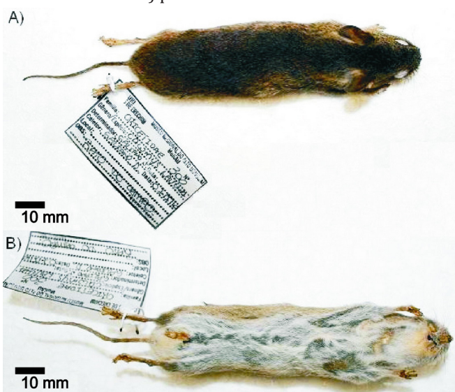
FIGURE 1. Adult female of Calomys laucha sampled in Faxinalzinho municipality, state of Rio Grande do Sul, southern Brazil. Dorsal (A) and ventral (B) views of a stuffed skin (Specimen: N° Zoo 300).

was sampled on 5 May 2010, in a shrubby area associated with forest borders in the city of Faxinalzinho. The specimen has a body length of 90 mm, tail length of 66 mm, ear length of 10 mm, foot length with nails of 16 mm, foot length without nails of 14 mm and weights 16 g. The individual was captured during a field study developed with the rodent community of that region, which consisted of three sampling periods between September 2009 and May 2010. In each trapping period, traps were placed randomly on the ground and the total trapping effort amounted to 2400 trap-nights (800 trap-nights per sampling). Standard Tomahawk® traps of one size (12cm x 12cm x 25cm) were used. Other rodents were concomitantly captured: Akodon montensis (36 specimens), Oligoryzomys flavescens (11), Oligoryzomys nigripes (4), Mus musculus (4) and Akodon reigi (2). The collection was held under the IBAMA (Brazilian Institute for the Environment and for Renewable Natural Resources) permit number: 15224-2.