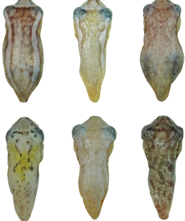
FIGURE 3. Dorsal color pattern variation found in individuals of Dendropsophus haddadi from Serra da Saudinha and Mata do Catolé, Maceió, Alagoas state, Brazil (from left to right MUFAL 5514, 3313, 5513, 9076, 3424 and 9778).

portions of Bahia and Espírito Santo) and shows that as