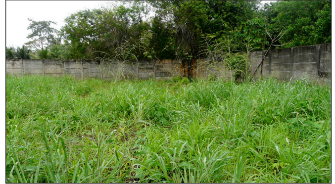
FIGURE 2. Disturbed area where the specimen of Bothropoides neuwiedi was found. Rio Tinto, PB.

the south coast, and in Agreste of Paraíba respectively (Dr. Helder Neves de Albuquerque, personal communication); however, there were no voucher specimens. Herein we present the first voucher specimen of Bothropoides neuwiedi for Paraíba state and the first record for the Atlantic Forest biome in the northern coast of Paraíba (Figure 3). In addition, this represents the northernmost record for the species.