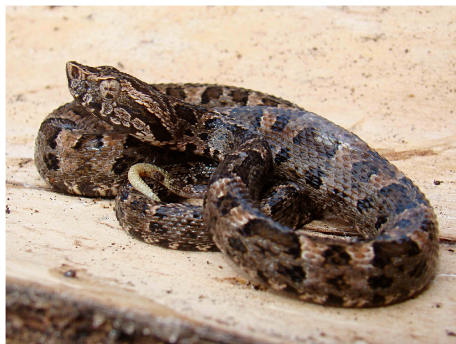
FIGURE 1. Bothropoides neuwiedi from the municipality of Rio Tinto, PB, Brazil.

On 18 June 2011, we collected a specimen of Bothropoides neuwiedi (Figure 1) in the city of Rio Tinto, PB. The individual was inactive in a disturbed forest patch at 09:30 h (06°48'513" S, 35°04'313" W) (Figure 2). Despite the snake being recorded in a disturbed area, the city is close to one of the most important reserves of northeast Atlantic forest, the Reserva Biológica Guaribas. This 4028-ha patch is part of the 2% of the original Atlantic forest remaining in northeast Brazil (Silva and Tabarelli 2000), and includes several fauna and flora species