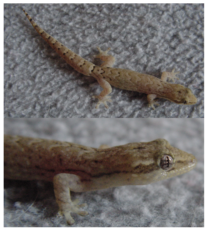
FIGURE 1. Lepidodactylus lugubris (UVC 14948). Specimen collected in San Cipriano, Valle del Cauca.

in order to better understand its current distribution and its pattern of colonization. For example, it is known that this species is more abundant in the Pacific region, while its presence in the Cauca rift valley is based on sporadic records, and it has not been recorded in the Yotoco forest, a locality on the east slope of the western range of the Andes, despite extensive herpetological survey work over a 30-year period (see Castro-Herrera et al. 2007).