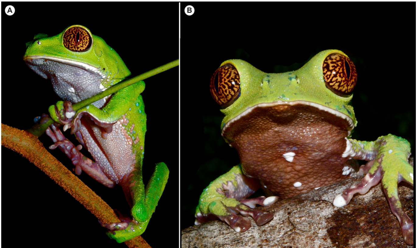
FIGURE 2. Specimens of Phyllomedusa tarsius collected in Guyana. A: UGCSBD HA1000 B: UGCSBD HA1001.

According to the International Union for Conservation of Nature (IUCN), P. tarsius is listed as "Least Concern" due to its wide distribution, tolerance of habitat modification, and a presumed large population size (La Marca et al. 2004). Considering the morphological variation of P. tarsius and its known widespread geographic distribution, a detailed taxonomic review is recommended.