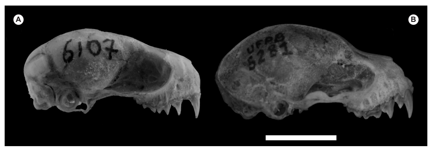
FIGURE 2. Lateral view of the skull of (A) Uroderma magnirostrum (UFPB 6107) and (B) Uroderma bilobatum (UFPB 5281). Scale bar = 10 mm.

yellowish edging (Davis 1968). All the external and cranial characters of the two U. magnirostrum specimens collected in the present study are in accordance with characters described by previous authors (Davis, 1968; Nogueira et al. 2003). Additionally, cranial measurements taken from the specimens from Sergipe fall within the range recorded for specimens collected in southeastern Brazil (Table 1).