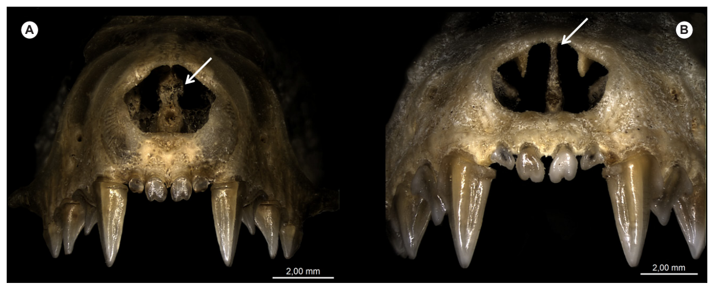
FIGURE 3. Frontal view of the skull of (A) Uroderma magnirostrum (specimen UFPB 6107) and (B) Uroderma bilobatum (specimen UFPB 5281). The mesethmoid bone is indicated by the white arrow.