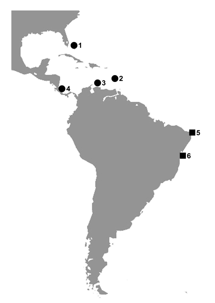
FIGURE 1. Geographic distribution of Flabellina dana . Previous records (circles): 1. Bahamas; 2. St. Lucia (type locality); 3. Curaçao and 4. Costa Rica (Valdés et al. 2006). New records (squares): 5. Rio Grande do Norte and 6. Bahia, Brazilian northeastern coast.

Among the Flabellinidae the species that most resembles F. dana is F. dushia. Some common characteristics are the opaque white color on the head, oral tentacles and most of the dorsum; the foot bilabiate and notched with long propodial tentacles; the pleuroproctic anus, posterior to inter-hepatic space; and the renal and genital opening location. However, the two species can be easily morphologically differentiated due to characteristics in the head, mouth and rhinophores. Flabellina dushia presents rounded head, terminal and triangular mouth and smooth rhinophores, while F. dana has oval head, vertical and sub-terminal mouth and annulate rhinophores (Millen and Hamann 2006; Valdés et al. 2006). The rhinophore is an important diagnostic characteristic of F. dana. It is the only known western Atlantic Flabellinidae with annulate rhinophores (Figure 2C) (Millen and Hamann, 2006).