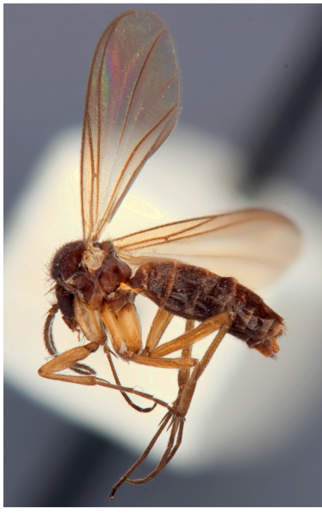
FIGURE 1. Left habitus of male Azana sinusa, Walterboro, SC, 4.iii.1989.

Current distribution: Maine south to South Carolina west to the Appalachian Mountains. These specimens represent a range extension of ~1200km for the species,