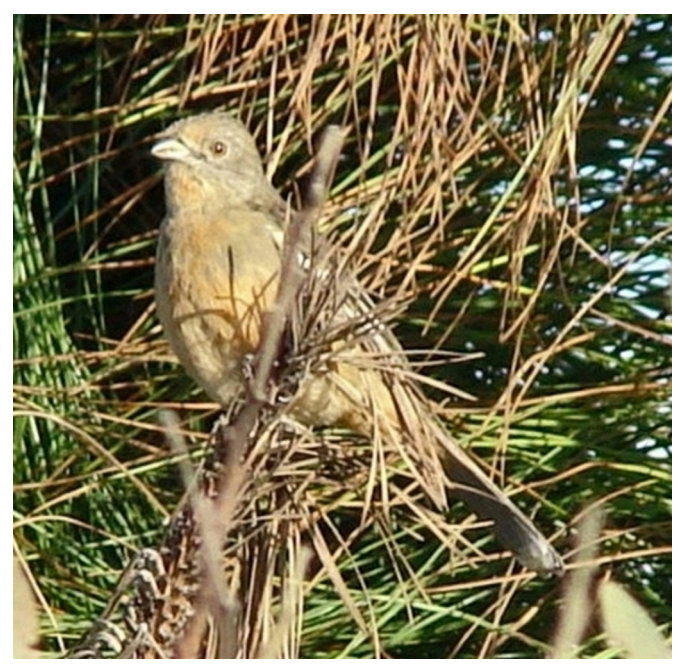
FIGURE 1. Phytotoma rutila recorded on 19 April 2009 in Capão da Canoa, state of Rio Grande do Sul, southern Brazil.

Here we report a second record of P. rutila in Brazil. On 19 April 2009, one individual (Figure 1) was recorded by J.A.F.S. at a coastal dunefield (29°42'19" S, 49°59'10" W) in Capão da Canoa, a municipality located on the northern coast of Rio Grande do Sul. The landscape is mainly herbaceous restinga , the typical vegetation cover of these coastal dunes (Waechter 1985). However, the bird was observed in a disturbed area dotted with shrubs of Acacia longifolia and young Pinus sp., both exotic plants in Rio Grande do Sul (Cordazzo et al. 2006). The distance from the shoreline was about 500 m. The bird had front and lower parts pale orange with grayish flanks. (Figure 1). These features indicated that the individual was an adult male, since immature males are buffy gray-brown below