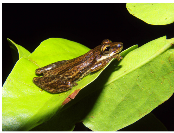
FIGURE 1. Adult female of Scinax cardosoi (MCNAM 14509), collected at municipality of Conceição do Mato Dentro, state of Minas Gerais, Brazil.

During field work on November and December 2009, AML and MHOB observed, recorded, and collected (permits #154/2009 NUFAS/MG, Instituto Brasileiro do Meio Ambiente e dos Recursos Naturais Renováveis - IBAMA, and #21185-1, Instituto Chico Mendes de Conservação da Biodiversidade - ICMBio) several individuals of S. cardosoi (Figure 1) in a few localities (Table 1) at Serra da Ferrugem (19°03'01"S, 43°23'57"W), Municipality of Conceição do