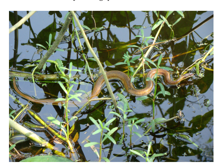
FIGURE 1. Xenochrophis cerasogaster amongst aquatic vegetation from Chor Kajol, Bangladesh.

extends the range of the species ca. 230 km SE (aerial distance) from the closest known area (Calcutta; see, Malnate and Minton 1965). The snake was located in a wetland, with dense aquatic vegetation (Enhydra fluctuans, Nymphaea nouchali). It was observed on 10 August 2009, at around 10:00 h on floating vegetation. Since the species is considered vulnerable in Bangladesh (Kabir et al. 2009), no specimen was collected from the study site. Rather voucher photographs were taken from a distance of about four meters with a Sony Cyber Shot DSC -H50 camera. One of these photographs (ZRC(IMG) 2.123) is deposited at the zoological image collection of the Raffles Museum of Biodiversity Research, Department of Biological Sciences, National University of Singapore.