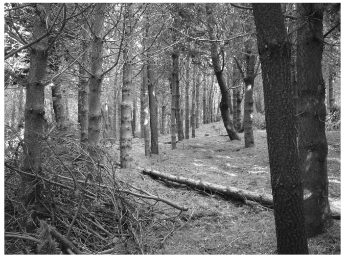
FIGURE 2. Pinus contorta plantation where the Irenomys tarsalis and Geoxus valdivianus specimens were found in Coyhaique National Reserve, Aysén.

In addition, the discovery of a specimen of Irenomys tarsalis and another of Geoxus valdivianus on a Pinus contorta forestry plantation helps broaden our understanding of the region's natural history. These records highlight our limited knowledge of this fauna and show the need to carry out additional field work and implement monitoring efforts that include disturbed and non-native habitats, which are dramatically increasing in area in Chile.