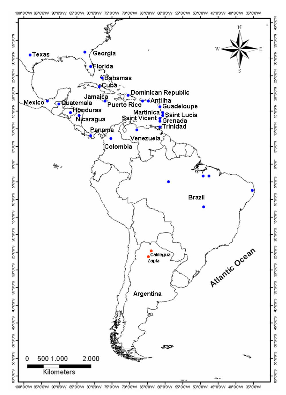
FIGURE 2. Gundlachia radiata. (A) Distribution map in the Americas, indicating the previous known locality (blue circles) and the new records (red circles).

Concerning G. radiata its current distribution ranges from southern United States to north and northern South America, with references to Texas (Basch 1963), Georgia and Florida (Basch 1963; Hubendick 1967); Central America: Antigua (apud Lanzer 1996), Bahamas (Hubendick 1967), Barbados (Schomburgk 1848), Costa Rica (Hubendick 1967), Cuba (Aguayo 1938, Hubendick, 1967), Dominican Republic (Malek 1985), Grenada (Harrison 1983), Guadeloupe (Hubendick 1967, Pointier 1976), Guatemala (Walker 1917, Goodrich and van der Schalie 1937, Hubendick 1967), Honduras (Pfeiffer 1858), Jamaica (Walker 1921, Hubendick 1967), Martinique (Aguayo 1966), México (Hubendick 1967), Nicaragua (Tate 1870, Hubendick 1967, Lanzer 1996, Thompson 2008), Panama (Zetek 1918), Puerto Rico (Harry and Hubendick 1963, Hubendick 1967), Saint Lucia (Harrison 1983), Saint Vincent (Harrison 1983) and Trinidad (Smith 1896);