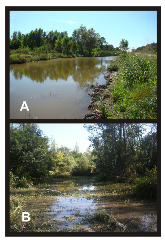
FIGURE 3. Temporary ponds inhabited by Gundlachia radiata in the province of Jujuy, Argentina. (A) Edge of the Route 34 on the road to Calilegua, (B) Zapla.

Route 34 on the road to Calilegua (23°33'43" S, 64°23'33" W) (Figure 3A). The second one was located in Zapla (24°13'10.2" S, 65°06'3.9" W) within an eucalyptus forest (Figure 3B). The specimens were found on sand banks surrounded by vegetation. The material was obtained through the examination of riparian and floating vegetation, with the help of fine mesh sieves. Most specimens were found attached to aquatic vegetation, branches and leaves of eucalyptus and grasses obscured by aging.