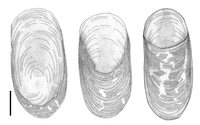
FIGURE 4. Gundlachia radiata. Drawings of shells (IML 15299) with septum on different stages of development.

The specimens were deposited at the Malacological Collection of the Miguel Lillo Institute (IML 15291, IML 15292 A, IML 15298 A, IML 15299), Tucumán province, Argentina. Specimens used to soft parts illustration were inserted into the Malacological Collection of the Universidade do Estado do Rio de Janeiro (Mol. UERJ 7841).