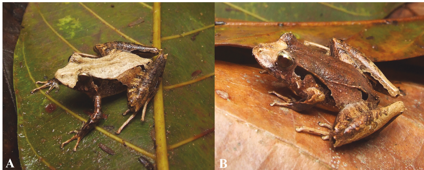
FIGURE 1. Ischnocnema oea from Usina da Fumaça, Muriaé, Minas Gerais. (A) MZUFV 8894 (SVL 25.18) and (B) MZUFV 8895 (SVL 22.52) (both females)

During a field expedition on 13 September 2008 in a forest fragment at the locality of Usina da Fumaça, municipality of Muriaé, state of Minas Gerais (42°26'48" S, 21°00'49" W), five males and two females of I. oea were collected on the forest floor. This is the first record of this species in the state of Minas Gerais. The record of I. oea in Muriaé extends its geographic distribution in approximately 227 km southwest from the type locality (Figure 2). These specimens were previously referred as