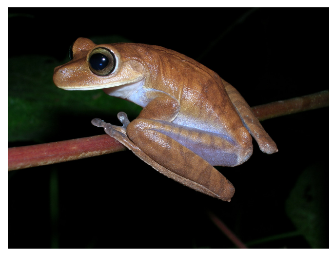
FIGURE 1. Adult live male of Bokermannohyla lucianae from Fazenda Santa Clara, municipality of Canavieiras, state of Bahia, Brazil.

The second population was found at the Private Reserve of Natural Heritage (RPPN) Serra Bonita (15°23'37.5" S, 39°33'58.1" W, 816 m above sea level), municipality of Camacan, Bahia. A male B. lucianae (MZUESC 8295) was collected at 21:30 h on 27 March 2010 when calling from a bromeliad 5.0 meters above the ground, next to an intermittent stream. Four other individuals of B. lucianae were heard at the same locality, all of them calling from bromeliads between 5.0 and 10.0 m height. A second expedition to the same stream resulted in the collection of two other specimens (MZUESC 8296-8297) on 8 May 2010 at 21:00 h. Both were located in a shrub between 50 and 70 cm above the ground. A survey of the amphibians of the RPPN has been underway since February 2009, consisting of visual and acoustic sampling at 36 sites. So far B.