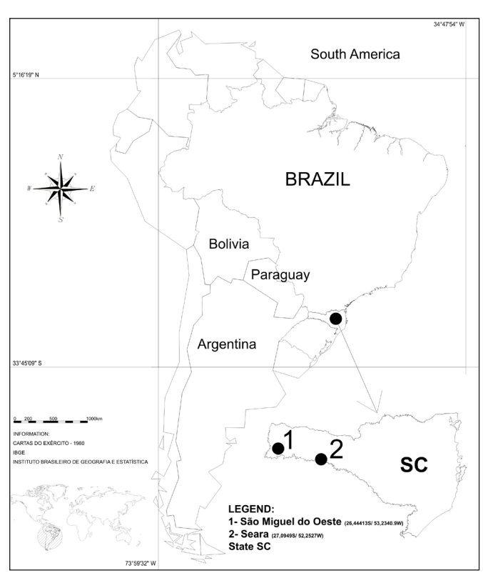
FIGURE 6. Map showing the new record of Crossodactylus schmidti in the municipalities of São Miguel do Oeste and Seara, state of Santa Catarina,

The state of Santa Catarina is entirely located in the Atlantic Forest domain, one of the world's biodiversity hotspots (Myers et al. 2000). Based on available information, it houses a high diversity of amphibians (Garcia et al. 2007a). Considering the scarcity of information on its diversity, additional information on the richness and geographic distribution of species at different regions of the state should be considered a priority, so as to support more effective conservation strategies.