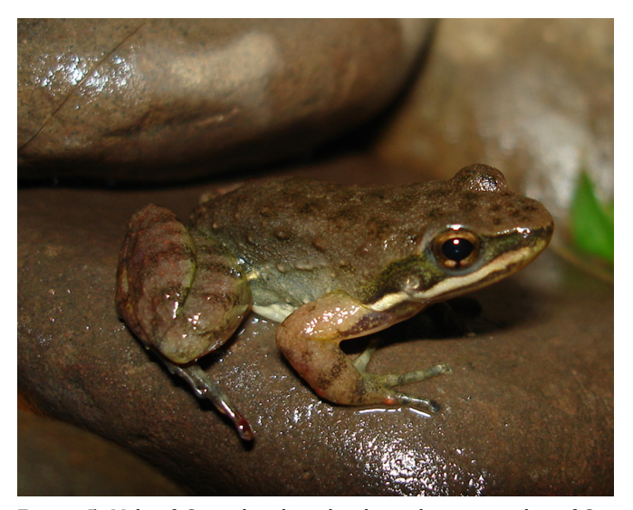
FIGURE 5. Male of Crossodactylus schmidti in the municipality of São Miguel do Oeste, state of Santa Catarina, Brazil.

Crossodactylus schmidti Gallardo, 1961, occurs in Argentina, southeast Paraguay, states of Paraná (Frost 2010) and Rio Grande do Sul (Caldart et al. 2010), southern Brazil, in elevation ranging from 300 to 750 m (Frost 2010). On 03 and 15 February 2007, around 18:00 h, we observed respectively 20 and 10 active individuals in a creek with rocky bottom and clear water, in a fragment of seasonal deciduous forest, in the municipality of São Miguel do Oeste, westernmost of Santa Catarina (26°44'41.3" S, 53°23'40.9" W; 270 m of elevation; Figures 5 and 6). The area comprises approximately 400 ha and is a property of the Brazilian Army, used for military training. The creek forms small waterfalls, and flows to the Rio das Antas. The individuals were observed on the rocks in the riverbed and margins of the creek, always very close to the flowing water. Collected specimens were housed at the Coleção Herpetológica da Universidade Federal de Minas Gerais (UFMG 3184 and 3185). In addition, 44 specimens of C. schmidti collected by the naturalist Fritz Plaumann, in Nova Teutônia (27°09'49" S, 52°25'27" W; Figure 6), municipality of Seara, western Santa Catarina, dated from 1951, are deposited as MZUSP 8725-8769.