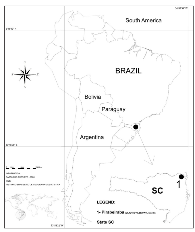
FIGURE 3. Map showing the new record of Scinax littoralis in the municipality of Joinville, state of Santa Catarina, Brazil.

(Carvalho-e-Silva et al. 2008). We examined a specimen of D. elegans (MZUSP 64718) from the municipality of Timbó, in the central Vale do Itajaí (municipality headquarters at 26°49'32" S, 49°16'18" W), state of Santa Catarina (Figure 4). This occurrence expands the distribution currently known for the species in 160 km southwestward (Lingnau and Bastos 2002).