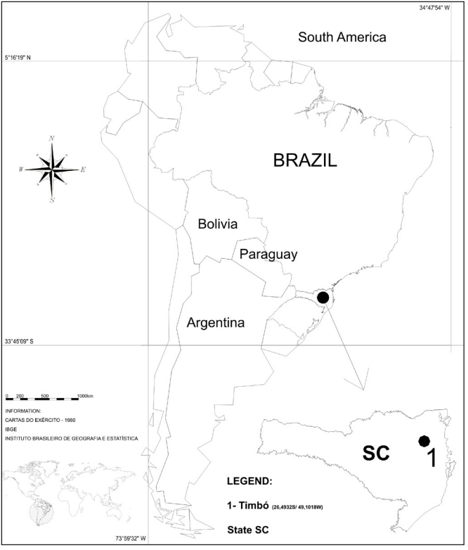
FIGURE 4. Map showing the new record of Dendropsophus elegans in the municipality of Timbó, state of Santa Catarina, Brazil.