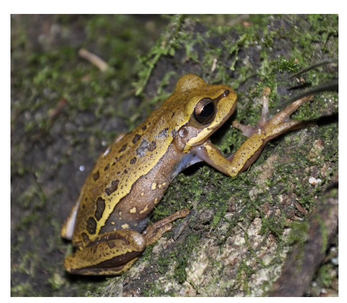
FIGURE 2. Female of Hypsiboas curupi from Parque Estadual Fritz Plaumann, municipality of Concórdia, state of Santa Catarina, Brazil.

In all occasions, we observed H. curupi males calling in the vegetation along creeks bordering or in the forest. The creeks had muddy bottoms and clear water. The microhabitat was similar to that reported by Iop et al. (2009). A maximum of eight individuals were observed in creek segments of up to 200 m. One record from Concórdia has been confirmed in a conservation unit (Parque Estadual Fritz Plaumann, 741 ha). Considering the current degraded condition of the mixed ombrophilous forests and seasonal deciduous forests in the state of Santa Catarina, the populations of H. curupi recently observed might be