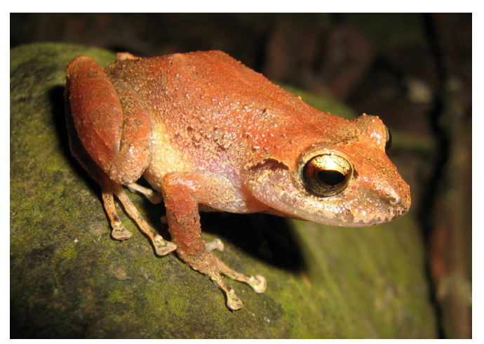
FIGURE 1. Specimen of Pristimantis palmeri from Vereda Morales, Municipality of Caloto, Cauca.

Our new record suggests that P. palmeri has a discontinuous distribution in the western slope of the Central Cordillera with a geographical gap in the Department of Valle del Cauca (Ramirez-Pinilla et al. 2004). However, this gap probably reflects insufficient sampling effort.