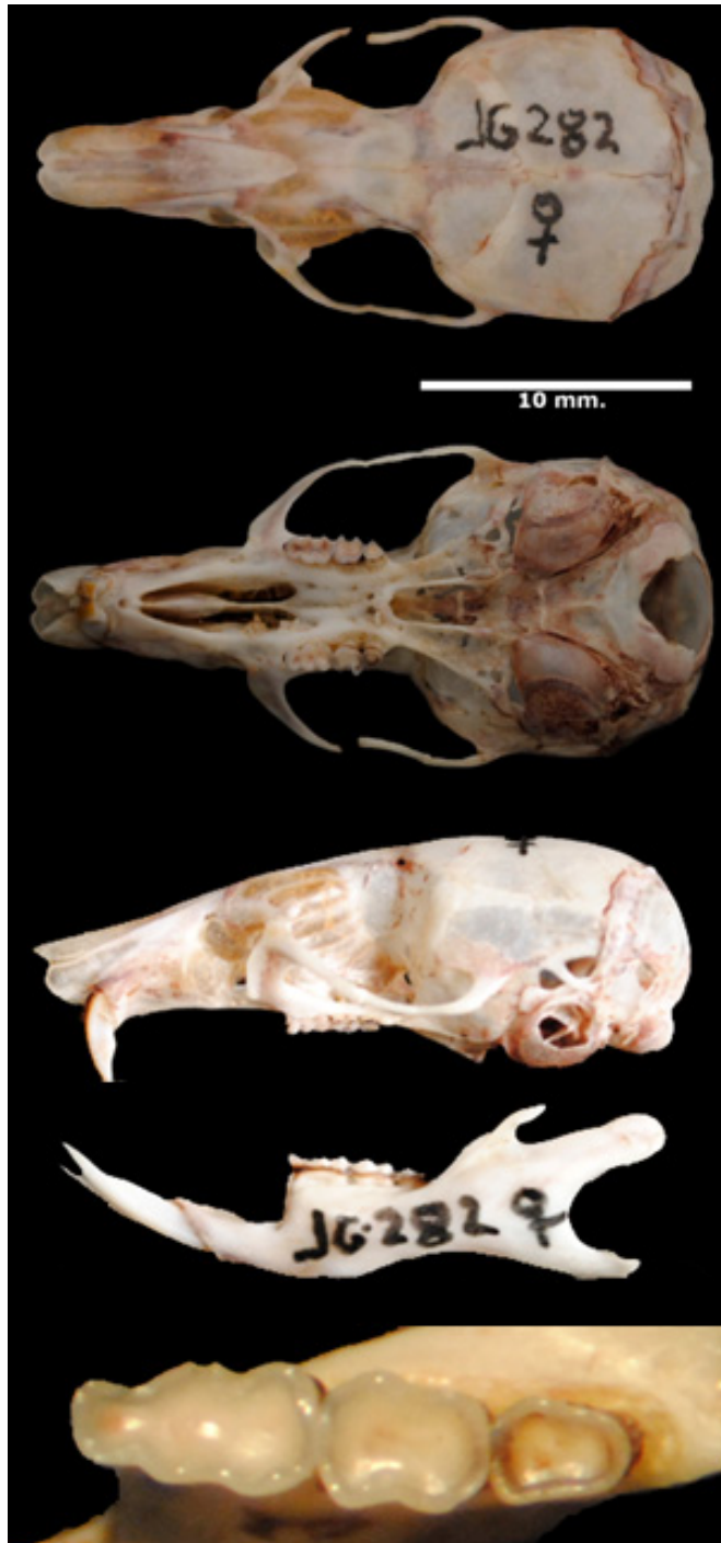
FIGURE 3. ReSkull, mandible and teeth of Abrothrix lanosus from Egg Channel in Madre de Dios Island (locality E; MZUC-UCCC - 32943). From up to bottom: dorsal, ventral and lateral skull views, left mandible in lateral view, and right tooththrow from mandible. Topotype MZUC-UCCC - 32943 (catalogue number); JG 282 (Jonathan Guzmán field number).