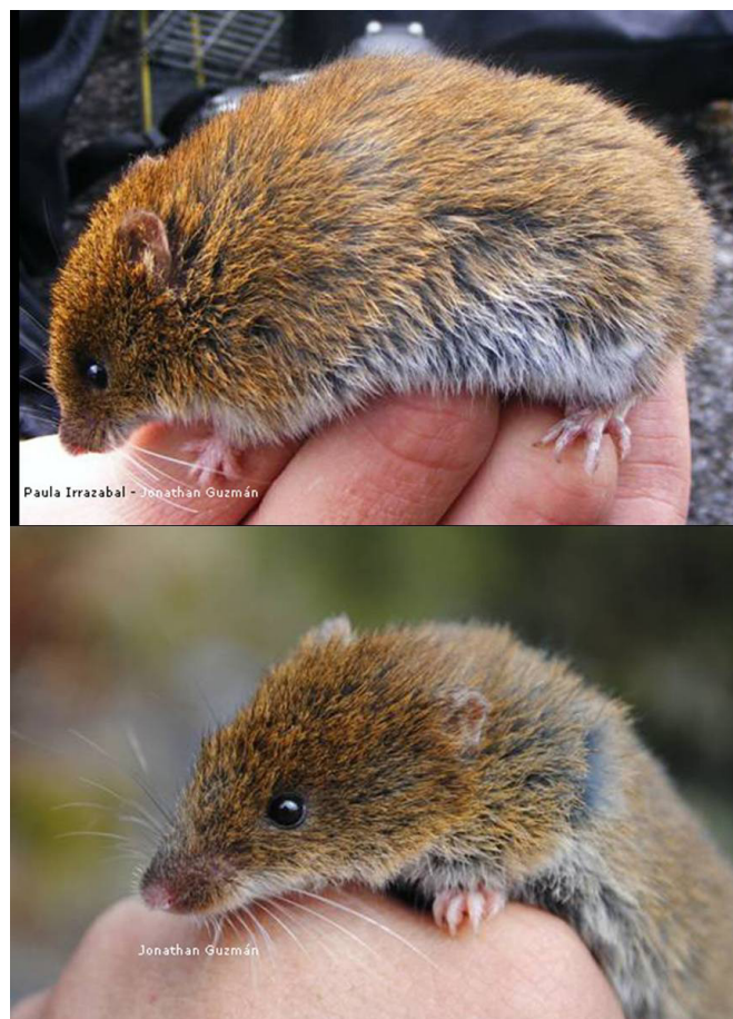
FIGURE 1. Abrothrix lanosus from Egg Channel in Madre de Dios Island (locality E; MZUC-UCCC - 32943) (photos by P. Irrazabal and J. Guzmán taken on 16 January 2010).

et al. 2009), a locality from which no more collections have been made. The present paper aims to contribute to the discussion of the species distribution on the basis of new collections, made in continental and insular Chilean Patagonia.