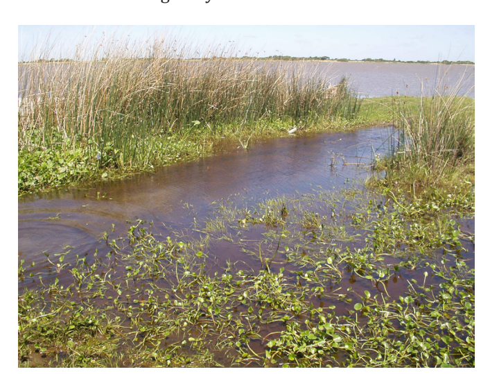
FIGURE 3. Occurrence site of Evorthodus lyricus in Pontal da Barra swamp, Patos-Mirim Laggon System, southern Brazil.

distribution. According to Foster and Fuiman (1987) the distribution of the species is probably related to coastal currents, affecting the dispersal of pelagic larvae. Evorthodus lyricus had parental care behavior, and adult males guarded egg masses, and removed physically smallsized predators from the vicinity of the burrow, previously excavated by the male. These authors suggest that the reproduction of the species is related to gradual freshening of the water during rainy seasons.