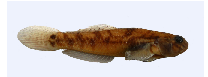
FIGURE 1. Evorthodus lyricus (CIMC 9048) captured in Rio Grande do Sul state, Patos-Mirim Lagoon System, southern Brazil.

On June and July 1992, seventeen individuals of E. lyricus were caught in drainage canal of Pontal da Barra swamp (31°47'08" S 52°14'29" W), Laranjal Beach, Pelotas County, Rio Grande do Sul state, southern Brazil (Figure 2A). Specimens were preserved in 70 % alcohol and identified based on Menezes and Figueiredo (1985). Voucher specimens are deposited at Coleção Ictiológica Morevy Cheffe, Grupo Especial de Estudo e Proteção do Ambiente Aquático do Rio Grande do Sul (CIMC 8991, 7, 19.4-38.2 mm SL; CIMC 9048, 5, 13.8-42.7 mm SL) and Museu de Ciências e Tecnologia, Pontifícia Universidade Católica do Rio Grande do Sul (MCP 17576, 5, 20.8-30.4 mm SL).