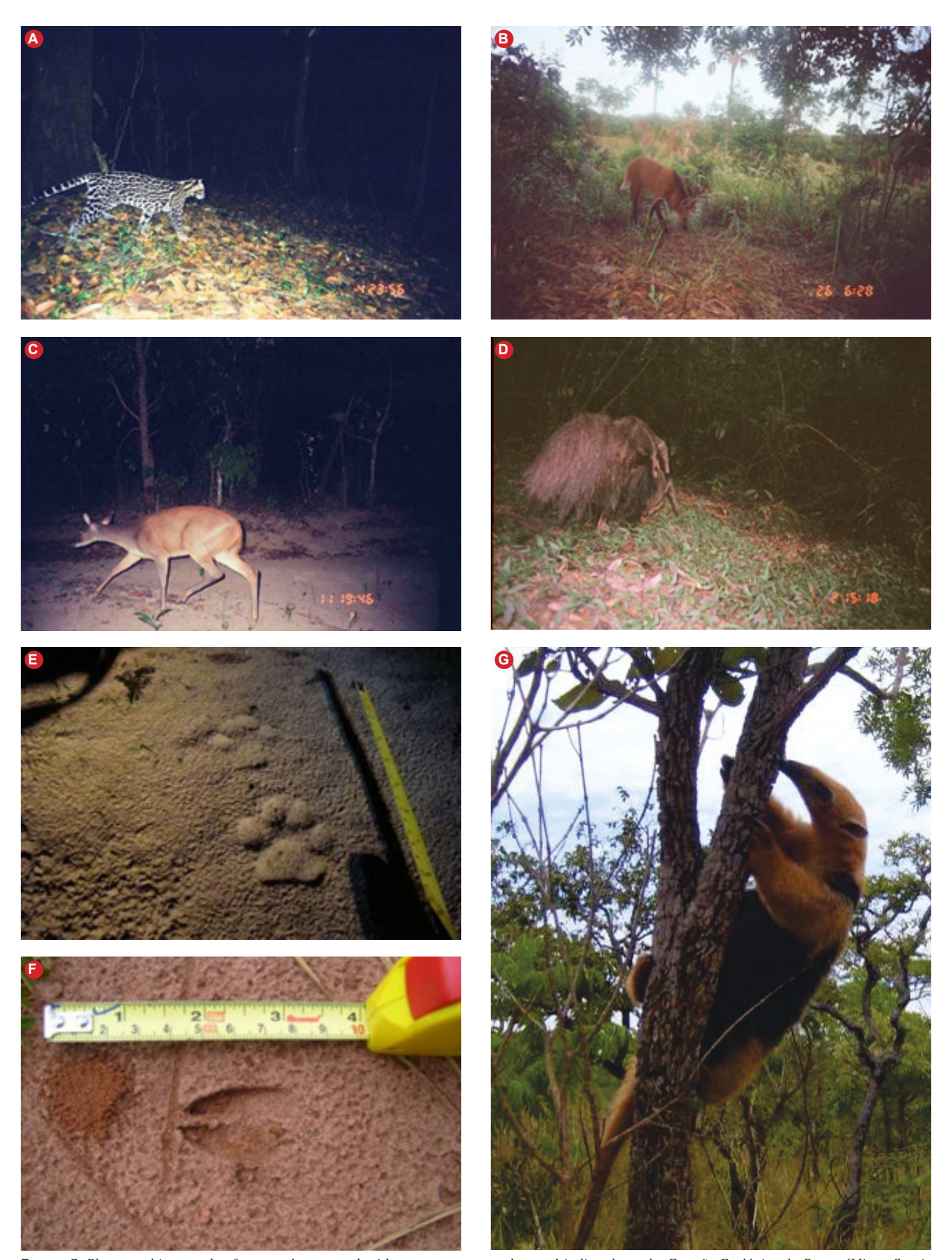
FIGURE 3. Photographic records of mammals captured with camera traps or observed indirectly at the Estação Ecológica do Panga (Minas Gerais State, Brazil). (A) Lepardus pardalis in mata ciliar, (B) Chrysocyon brachyurus in vereda, (C) Mazama guazoubira in cerrado sentido restrito, (D) Adult Myrmecophaga tridactyla carrying juvenile in mata ciliar, (E) Puma concolor tracks in cerrado sentido restrito, (F) Mazama guazoubira track in cerrado ralo, (G) Tamandua tetradactyla in cerrado ralo.