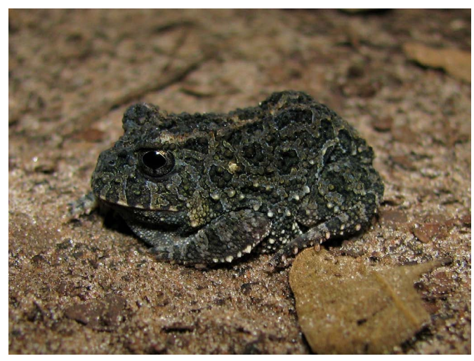
FIGURE 1. Individual of Proceratophrys moratoi collected in the Jardim Botânico Municipal de Bauru, Bauru, state of São Paulo, Brazil.

Fieldworks were carried out between November 2008 and January 2009 at Jardim Botânico Municipal de Bauru (22°20'48.46" S, 49°0'56" W; 550 m). This place occupies 321.71 ha and is predominantly composed of