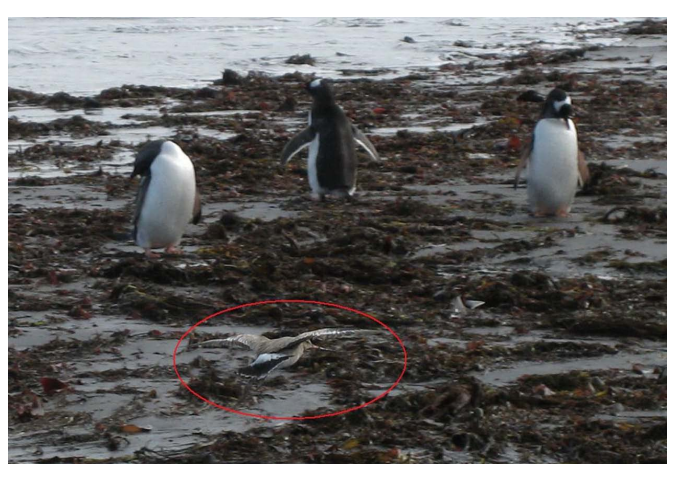
FIGURE 3. Hudsonian Godwit Limosa haemastica flying at Potter Peninsula, 25 de Mayo/King George Island, South Shetland Islands, 24 October 2008.

ACKNOWLEDGMENTS: We thank the Servicio Meteorológico Nacional (Argentina) for providing the meteorological data from Esperanza and Jubany Base (IAA).