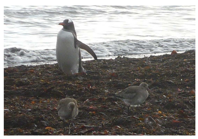
FIGURE 2. Two individuals of Hudsonian Godwit Limosa haemastica at Potter Peninsula, 25 de Mayo/King George Island, South Shetland Islands, 21 October 2008.

The most common factor offered to explain vagrancy according to these authors are unusual weather conditions, such as storms or droughts, which drive birds away from their normal distribution and migration routes (Orgeira and Fogliatto 1991). Strong winds were registered in both years just before the dates when the Limosa haemastica reported herein were observed. From the end of December 2004 to the beginning of January 2005 winds over 40 knots, especially from the north, prevailed in the Esperanza Base area. Similar conditions were registered in October 2008 at Jubany Base, where the strong northerly winds reached 22 - 46 knots, exceeding 50 knots in September. It could well be that the presence of these birds in our study areas is associated with these weather conditions, such as the wind speed and direction, thus facilitating their movement south from southern South America.