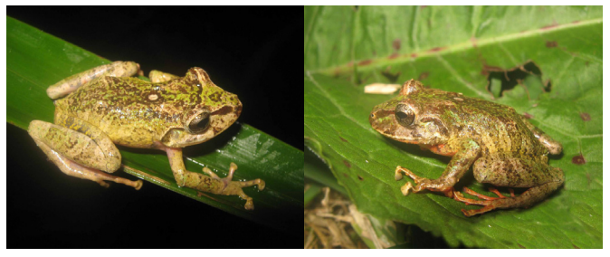
FIGURE 1. Specimens of Pristimantis permixtus from Chicoral, Valle del Cauca.

Pristimantis permixtus (Lynch, Ruiz-Carranza, and Ardila-Robayo, 1994) is a moderate sized frog (Figure 1), belonging to the Pristimantis unistigratus species group ( sensu Hedges et al. 2008). The species is endemic to Colombia, distributed in the departments of Tolima, Valle del Cauca, Risaralda, Caldas and Antioquia on the Central Cordillera, and Jerico (Antioquia) in the Occidental Cordillera, between 2400 and 3700 m above sea level (Lynch et al. 1994; Ruiz-Carranza et al. 1996). However, Lynch et al. (1994) considered the distribution of the species in the Occidental Cordillera (Jerico) needed to be confirmed as it is an isolated record for this Cordillera. The species inhabits upper cloud forests and sub-páramo areas (Lynch et al. 1994).