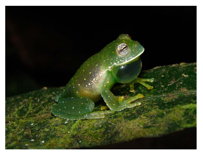
FIGURE 1. Lateral view of an adult male of Centrolene daidaleum from the Sierra de Perijá, Venezuela (Photo: F.J.M. Rojas-Runjaic).

Centrolene daidaleum is considered endemic to the Cordillera Oriental of the Colombian Andes, and known only from eight localities between 1,600 and 2,060 m (Figure 3). The type-locality of the species is: Granja Infantil del Padre Luna, Vereda Las Marías, municipio de Albán, departamento de Cundinamarca, western slope of the Andean Cordillera Oriental, Colombia, at 2,060 m (Figure