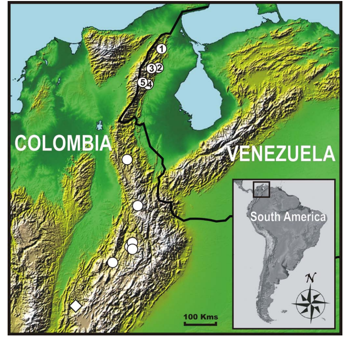
FIGURE 3. Geographic distribution map of Centrolene daidaleum . Dots numbered from 1-5: New locality records from the Sierra de Perijá, Venezuela. 1. Quebrada El Gocho, Fundo El Progreso, Río Socuy upper basin; 2. Creek near base camp of the Cerro Las Antenas, Río Lajas basin; 4. Indigenous community of Manastara, Río Negro basin; 5. Río Tétari Kopejoacha, Campamento Guacharaca, Río Negro basin. White dots: localities recorded from Colombia (Ruiz-Carranza and Lynch 1991; Rada et al. 2007; Rada and Guayasamin 2008; Daza and Barrientos 2005). White rhomb: type locality (Ruiz-Carranza and Lynch 1991).

Centrolene daidaleum has been recorded in Colombia from streams in premontane forest, cloud forest, and even secondary forest on the western slope of Cordillera Oriental (Ardila-Robayo and Rueda 2004). The five new Venezuelan localities are also in premontane, montane and cloud forests. Almost all small rivers were surrounded