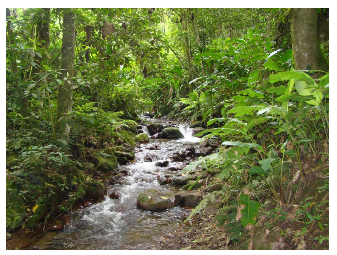
FIGURE 4. Habitat where Centrolene daidaleum was found at Campamento Guacharaca, Río Tétari Kopejoacha, Sierra de Perijá, Venezuela.

However, the new localities in the Venezuelan Sierra de Perijá significantly increase its distribution, indicating that the species has an extent of occurrence much wider than previously known. Two Venezuelan populations (Manastara and Campamento Guacharaca) occur inside the Parque Nacional Sierra de Perijá. A reassessment of the conservation status of the species is required in order to include new data.