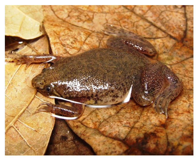
FIGURE 1. Pipa carvalhoi (MZUFV 8671, female, in life) from Sete Cachoeiras, municipality of Ferros, Minas Gerais.

2008). Herein we present data on the distribution of P. carvalhoi in the southeast of Brazil, as also new records in state of Minas Gerais, improving the knowledge about its geographic distribution.