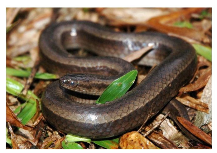
FIGURE 1. Specimen of Brazilian burrowing snake, Gomesophis brasiliensis , captured in Vargem Bonita, state of Santa Catarina, Brazil.

In spite of a wide distribution, just few records exist for this species and its geographic range remains unclear. G. brasiliensis type locality is Pindamonhangaba, state of São Paulo, Brazil (Gomes 1918). According to Peters and Orejas-Miranda (1970) this species occurs in the states of Minas Gerais, São Paulo, Paraná and Rio Grande do Sul. It has also been recorded in Central Brazil, in Águas Emendadas Ecological Station, Distrito Federal (Prudente and Brandão 1998). In state of Santa Catarina G. brasiliensis was known from only one locality until recently, Alto Vale