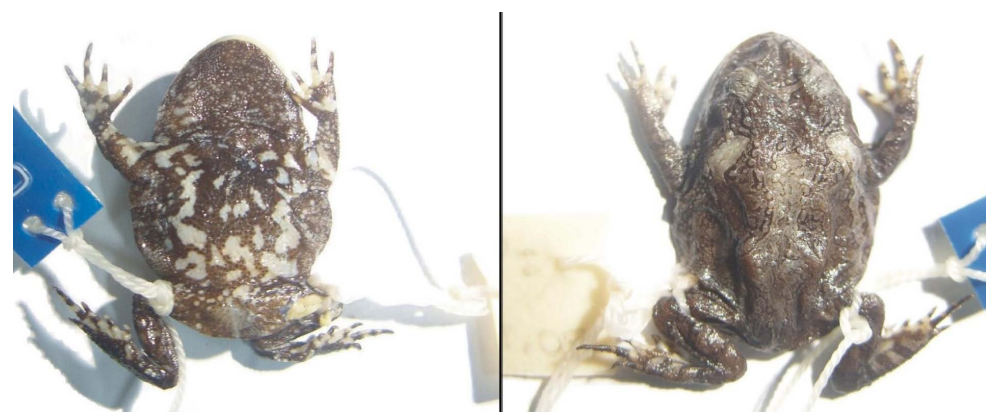
FIGURE 1. Proceratophrys avelinoi specimen CZ 0483 housed at the CZ FACEN; ventral view (left), dorsal view (right).

On September 12, 2008, sampling was conducted within Limoy Biological Reserve, located in eastern most Paraguay (Figure 2), along the banks of the Parana River, in the Department of Alto Paraná; San Alberto district, approximately 24°45' S, 54°26' W. Limoy is a reserve which included approximately 16,000 ha of Interior Atlantic Forest. The specimen was collected using a 110 meter pitfall-trap with drift fence. The pitfall included eleven 20 liter buckets which were separated by 10 m each. The pitfall was run for eight consecutive nights. The buckets were filled to about one tenth of their sizes with water. After caught the specimen was sacrificed using 30 % alcohol,