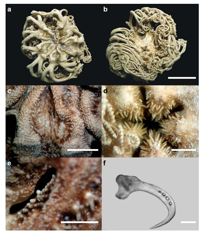
FIGURE 2. Gorgonocephalus chilensis. Aboral view (A); adoral view (B); radial shields (C); oral surface and jaws (D); genital slit (E); brachial spine (F). Scales: (A),(B) = 20 mm; (C) = 5 mm; (D) = 3 mm; (E) = 2 mm; (F) = 0,05 mm.

ventral interadial area (Figure 2E). The arms are densely granulated and the first branch, of the total of five, occurs at the distal edge of the disk. Arms spines are modified into microscopic pointed hooks (Figure 2F) forming rings around the arms. The first two tentacle pore have no tentacle scales associated with it and the follow ones has two to four scales that increases towards the distal segments.