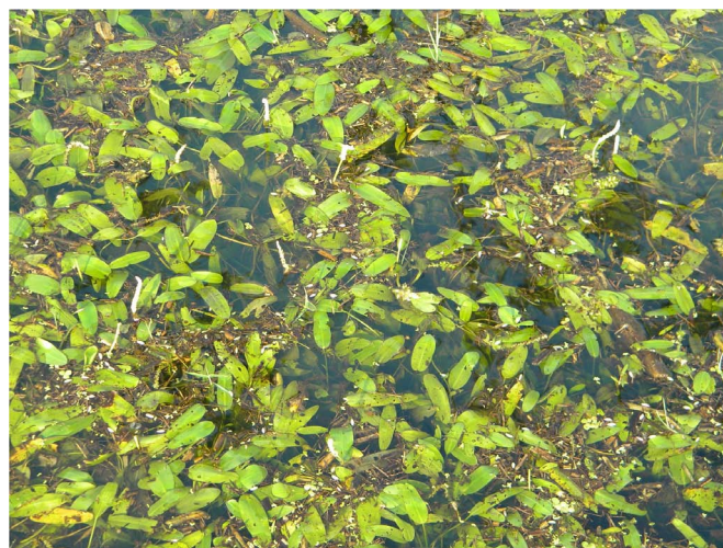
FIGURE 4. Aponogeton natans , an edible tuber yielding hydrophyte establishing life on low-depth areas.