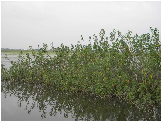
FIGURE 9. Ipomoea carnea an alien invasive weed.