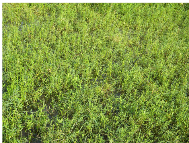
FIGURE 3. Alternanthera sessilis grows luxuriantly on shores of the lakes.

Among five morpho-ecologic groups, emergent anchored with 23 species dominated the lakes followed by floating (eight), floating leaved anchored and submerged anchored (six each), and submerged with two species. Presence of Ipomoea carnea , Pistia stratiotes , Eichornia crassipes indicated a clear sign of invasion of alien species in these lakes (Figures 9 and 10). Quantitative and qualitative floristic survey, constant monitoring and protection of lentic and lotic ecosystems are the need of the hour in order to save the native biota, to maintain the quality of drinking water, and disqualify the efforts of alien species to invade.