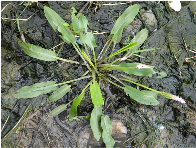
FIGURE 5. Aponogeton natans in flowering.