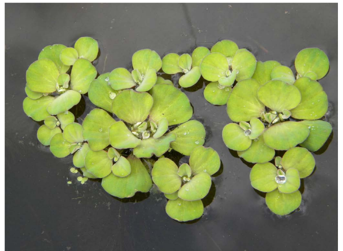
FIGURE 10. Pistia stratiotes an alien invasive, aggressive weed.