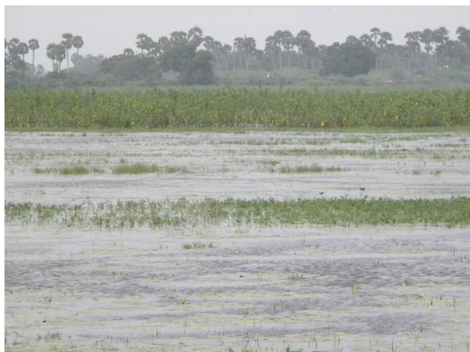
FIGURE 2. Part of the lake Palavedu (PV) in early days of water filling period at Thiruvallur District, Tamil Nadu, India.

Mean depth of lakes varied across the sites 185, 170, 257, 234 and 248 cm in NK, NC, PV, TD and TR respectively. Filling up of water in the lakes is taking place during the month of October-November (Figure 2). Inundation period of lakes is about eight months (October-June) and they remain dry for four months (July-September) in a year. Thiruvallur, a coastal district (12°10' and 13°15' N, 79°15' and 80°20' E) has an area of 3424 km 2 , with Bay of Bengal and Chennai on the east, state of Andhra Pradesh (north), Kanchipuram district (south) and Vellore district on the west.