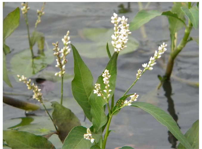
FIGURE 8. Polygonum glabrum grows throughout the year in and around the lake.