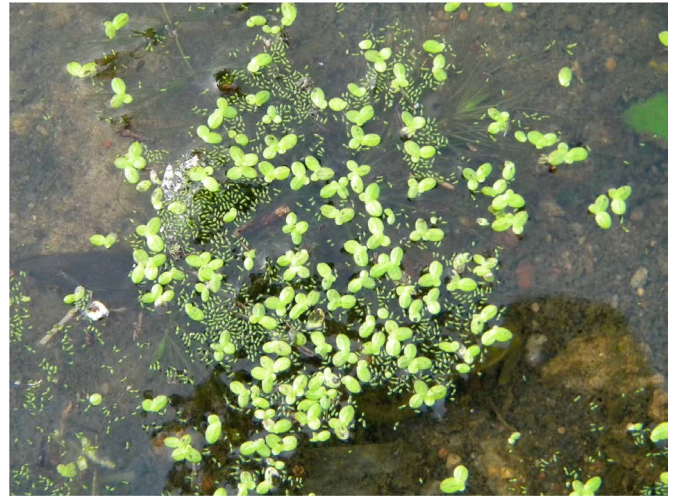
FIGURE 6. Lemna gibba a small, pioneer colonizer of fresh water ecosystem, associated to the tiny Wolffia globosa .