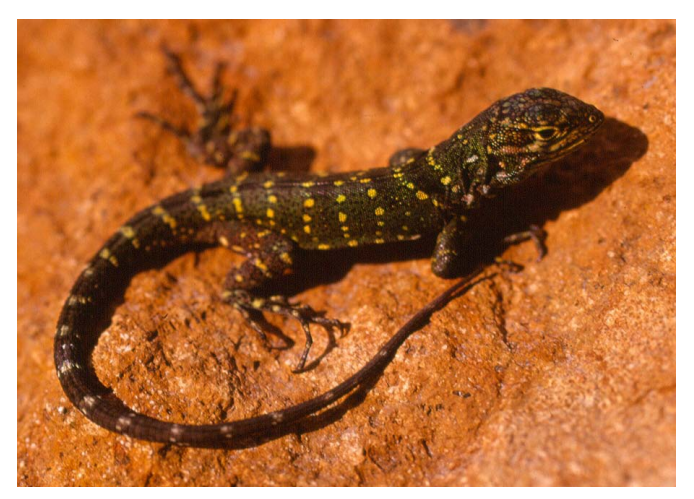
FIGURE 3. Dorsolateral view of juvenile male of Stenocercus humeralis (CORBIDI 00936) collected at Cerro Yantuma, Ayabaca, Peru.

This new record extends the known species' distribution ca. 78.5 km SW from the southernmost record at 12.2 km south of Loja (Malacatos River Valley on road to Vilcabamba; Torres-Carvajal 2007a) (Figure 4). Stenocercus humeralis was not reported by Carrillo and Icochea (1995) or Lehr (2002) in their lists of reptiles from Peru.