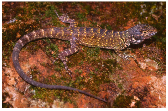
FIGURE 4. Dorsolateral view of adult male of Stenocercus humeralis (CORBIDI 00940) collected at Cerro Yantuma, Ayabaca, Peru.

ACKNOWLEDGMENTS: Fieldwork was made possible by Nature & Culture International (NCI) in Peru. Karen Siu-Ting provided the map and Jeremy Flanagan reviewed the manuscript.