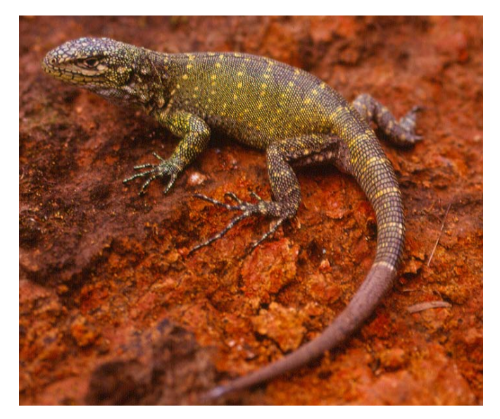
FIGURE 2. Dorsolateral view of adult female of Stenocercus humeralis (CORBIDI 00939) collected at Cerro Yantuma, Ayabaca, Peru.

Stenocercus humeralis was considered as restricted to the interandean valleys of the Catamayo (Pacific drainage) and Zamora rivers (Atlantic drainage), at elevations between 2,000-3,000 m, province of Loja, southern Ecuador (Torres-Carvajal 2000; 2007a; 2007b).