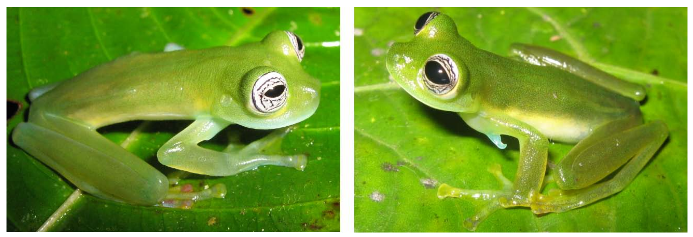
FIGURE 2. Adult males of Sachatamia ilex (left) and Espadarana callistomma (right) not collected. Reserva Forestal San Cipriano-Escalerete, Valle del Cauca, Colombia. Note the exposed humeral spine of E. callistomma, and the concealed humeral spine of S. ilex, embedded in the arm muscles.