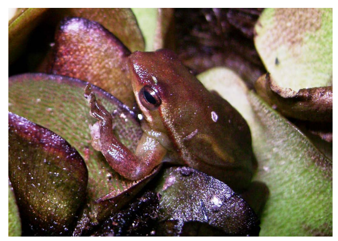
FIGURE 2. Adult male Sphaenorhynchus botocudo (MZUFV 9824 – SVL 28.6 mm) with emphasis on the presence of the distinctive longitudinal white spot under the eye, a putative autapomorphy of the species.

preservative (Figure 3), which separates S. botocudo from all other congeners, consisting in a putative autapomorphy of the species (Caramaschi et al. 2009).