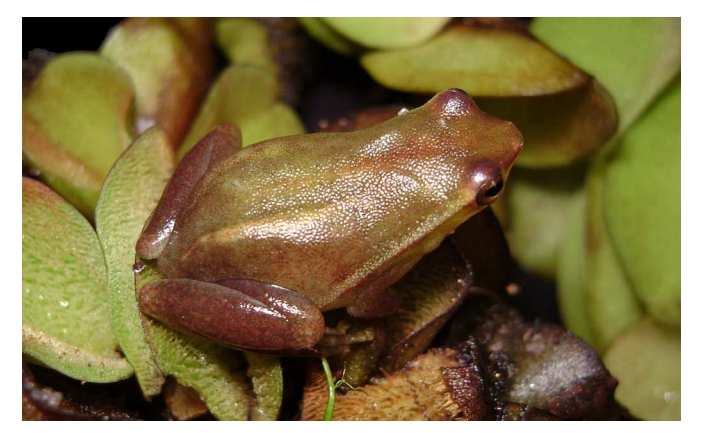
FIGURE 1. Adult male Sphaenorhynchus botocudo from Fazenda Santa Clara, municipality of Mucuri, state of Bahia, Brazil (MZUFV 9824 – SVL 28.6 mm ).