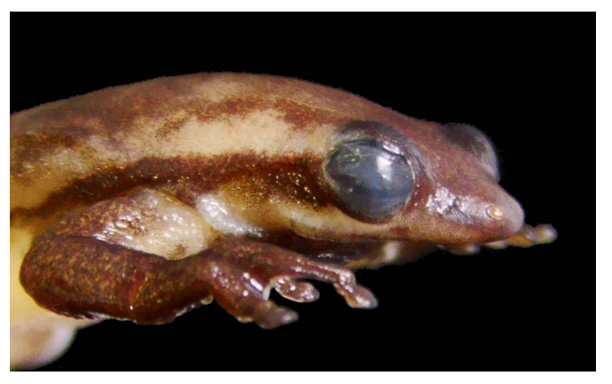
FIGURE 3. Adult male Sphaenorhynchus botocudo in preservative with emphasis on the presence of the distinctive longitudinal white spot under the eye, a putative autapomorphy of the species.