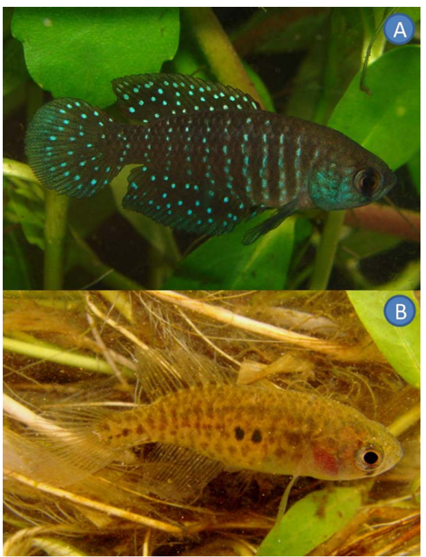
FIGURE 1. Male (A) and female (B) of Austrolebias periodicus, captured in Lajeadinho stream floodplains, Alegrete, Brazil.

fragmentation of its habitat, mainly due to rice cultivation in the area of occurrence (Fontana et al. 2003; Rosa and Lima 2008). Austrolebias periodicus (Figure 1) distribution in Brazil was only known to four populations in Dom Pedrito and Rosário do Sul municipalities, Santa Maria and Ibicuí da Armada rivers basins respectively (Fontana et al. 2003; Costa 1999; 2002b; 2006). In this study its occurrence is extended to four new areas and two new municipalities, all located in the Ibicuí River basin (Figure 2B).