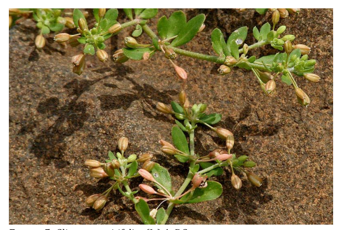
FIGURE 5. Glinus oppositifolius (L.) A. DC.