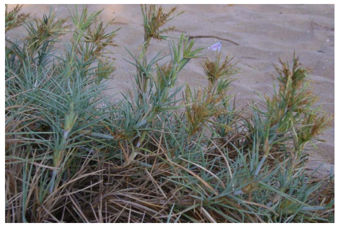
FIGURE 4. Spinifex littoreus (Burm. f.) Merr.