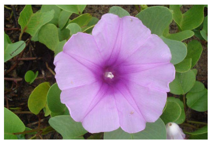
FIGURE 2. Ipomoea pes-caprae L. R. Br.

As several authors have pointed out in various parts of the world, many dune ecosystems support high plant richness and diversity values ( e.g. Musila et al. 2001; Grootjans et al. 2004; Fontana 2005; Celsi and Monserrat 2008). In this sense, the present work also indicates that the study area preserves a rich flora with high number of native dune plants. Moreover, the different vegetation formations together with the dune field geomorphologic heterogeneity provide a wide variety of environmental conditions and habitat types that support a diverse native fauna like Crabs, Dune Lizards etc. The conservation of the native vegetation of the CSD is a priority to conserve the integrity of the natural communities in coastal regions.