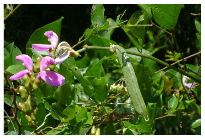
FIGURE 3. Canavalia cathartica Thouars.