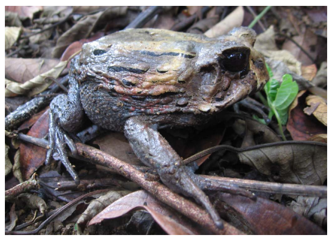
FIGURE 1. Adult of Macrogenioglottus alipioi, municipality of Ibateguara, state of Alagoas, Brazil.

During a short survey in March 2007 (collection permit IBAMA #11218-1), an adult of M. alipioi (Figure 1) was captured in a pitfall trap located at 400 m above sea level and 60 m from the edge of the Coimbra forest, a large Atlantic forest fragment (3,500 ha; 08°59'28" S, 35°50'22" W) at the Usina Serra Grande, municipality of Ibateguara, north of the state of Alagoas (Figure 2). The surroundings of the traps were characterized by the presence of small trees, lianas and deep leaf-litter.