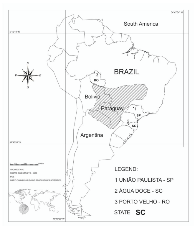
FIGURE 1. New record of Phyllomedusa azurea in the (1) municipality of União Paulista, state of São Paulo (Prado et al. 2008), (2) municipality of Água Doce, state of Santa Catarina (present study), and (3) municipality of Porto Velho, state of Rondônia (Calderon et al. 2009). The stripped area corresponds to the species geographic distribution proposed by Angulo (2008).

The type locality of P. azurea is unknown, mentioned simply as 'Paraguay' in original description. Its occurrence is recorded in the regions of Chaco, east of Bolivia, from Paraguay to northern Argentina, Cerrado and Pantanal in Central Brazil in the states of Mato Grosso, Mato Grosso do Sul, Tocantins, Goiás, Distrito Federal, Minas Gerais and São Paulo (Caramaschi 2007 "2006"; Prado et al. 2008; Frost 2009), and recently from a transitional region between the Cerrado and the Amazonian Forest biomes in state of Rondônia, in northern Brazil (Calderon et al. 2009). This species is typical from open habitats. During its reproductive season it can be found mainly in swampy