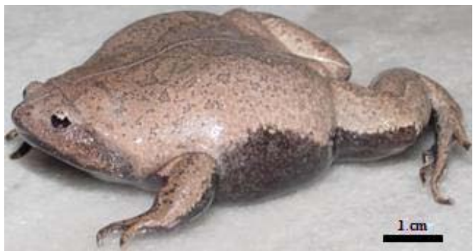
FIGURE 1. Male specimen of Stereocyclops incrassatus (CHBEZ555) obtained at Mata da Cachoeira, Usina Serra Grande, São José da Lage, state of Alagoas, northeastern Brazil.

The specimens of S. incrassatus reported herein were collected in three Atlantic Rainforest fragments, one located in the state of Alagoas and two in the state of