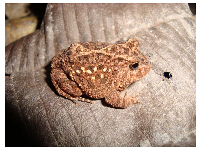
FIGURE 1. A male specimen of Odontophrynus moratoi from São Carlos, state of São Paulo, Brazil.

During field works conducted in municipality of São Carlos (22°01'00.5" S, 47°56'21.0" W, 810 m above sea level), state of São Paulo, between 1 February and 5 February 2009, males of O. moratoi were observed