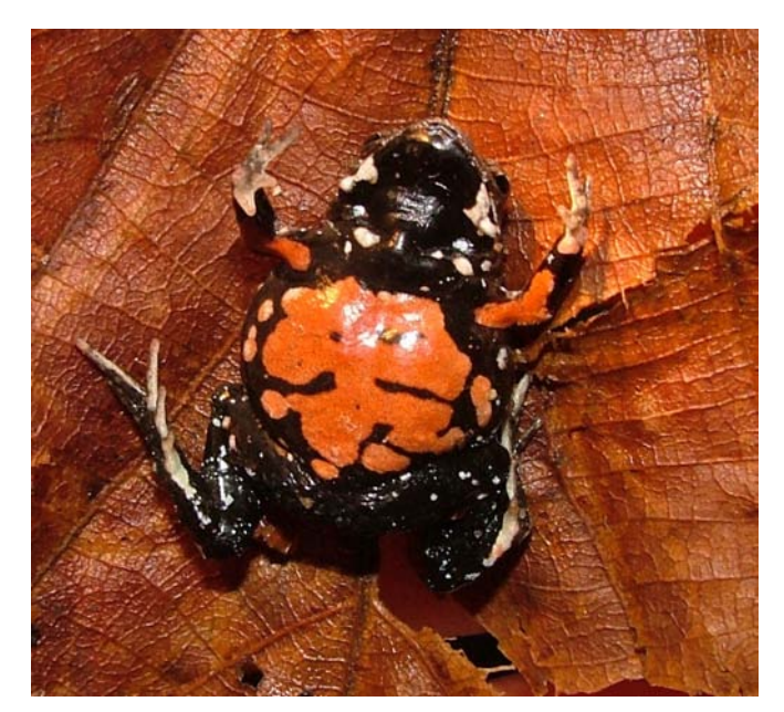
FIGURE 2. Ventral view of MNRJ 51501 in life.