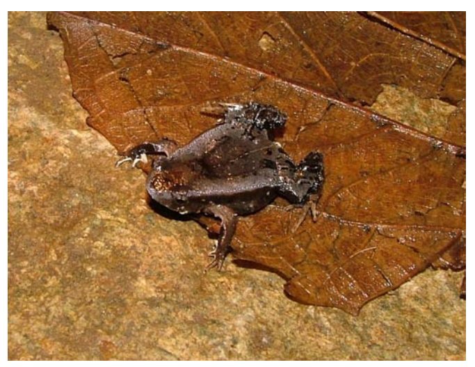
FIGURE 1. Dorsal view of live adult female Paratelmatobius mantiqueira (MNRJ 51501) from the municipality of Resende, state of Rio de Janeiro, Brazil.

On 14 November 2005 at 20:45 h a female Paratelmatobius mantiqueira (snout-vent length = 22 mm)