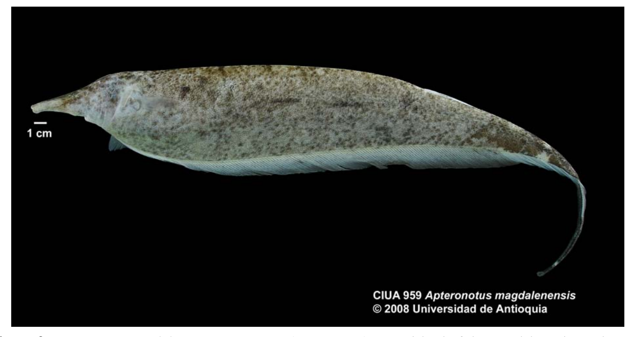
Figure 2. Apteronotus magdalenensis, CIUA 959 (SL 364 mm) on an island of the Magdalena river.

The local fishermen who helped us collect these specimens call A. magdalenensis "el original perro" (which translated means "original dog"). In other parts of the river it is called "caballo" (horse) or "perrita" (little dog). They told us that it is a rare but not unknown fish. In the town of Berrio they reported that very large ones are sometimes eaten, but in the Sogamoso river they are used for bait to catch large Tiger Catfish (Pseudoplatystoma magdaleniatum Buitrago-Suarez & Burr 2007). Additional field work will probably reveal that some fish we now consider to be rare, especially those described long ago such as this one, are more abundant than is commonly thought. However, although more extensive collecting is needed to find populations of seemingly scarce fishes, the Magdalena basin desperately needs efforts to guarantee its conservation. Poor land management practices associated with agriculture, cattle ranching and urban development have led to heavy erosion and sedimentation of the river (Galvis and Mojica 2007), and high levels of contamination from sewage, fertilizers and toxic chemicals. Apteronotus magdalenensis have undoubtedly suffered, but populations their population numbers remain unknown (Mojica and Castellanos 2002). few specimens known of this species indicate that it remains one of the most vulnerable species endemic to the basin.