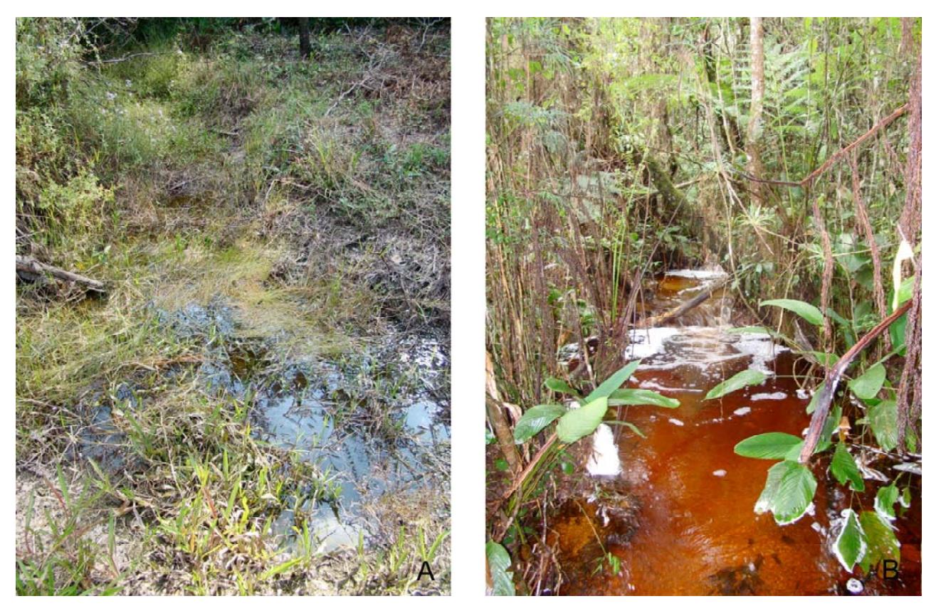
Figure 3. Open (A) and forest (B) area where individuals of Scinax cardosoi were observed at Reserva Particular do Patrimônio Natural Ovídio Antônio Pires , municipalities of Santa Rita da Jacutinga and Bom Jardim de Minas, state of Minas Gerais.