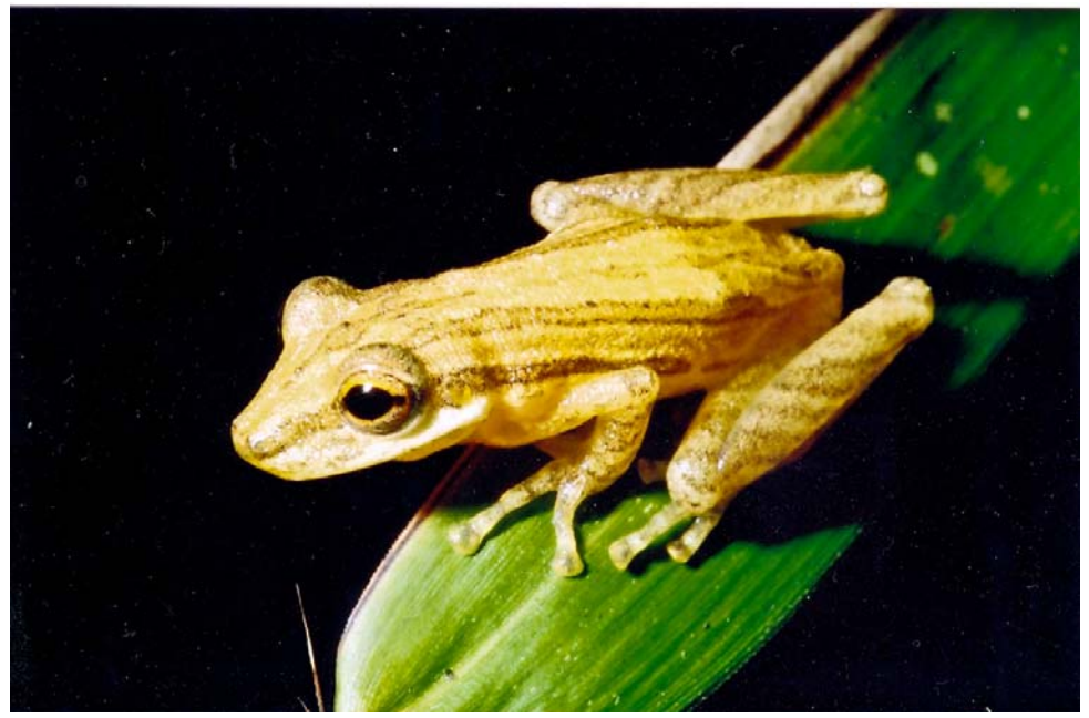
Figure 1. A male individual of Scinax cardosoi from Reserva Particular do Patrimônio Natural Ovídio Antônio Pires , municipalities of Santa Rita da Jacutinga and Bom Jardim de Minas, state of Minas Gerais.

Scinax cardosoi was described from Vale da Revolta, municipality of Teresópolis, state of Rio de Janeiro, Brazil. According to Frost (2009), this species occurs only on the vicinity of the type locality in the state of Rio de Janeiro, Brazil. However, at the description of this species, the type material also included specimens from the municipality of Domingos Martins at the state of Espírito Santo (Carvalho-e-Silva and Peixoto 1991). In the present paper we report new records for Scinax cardosoi at the state of Minas Gerais, Brazil.