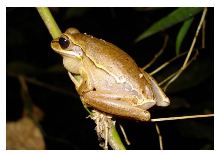
Figure 1. Adult male of Hypsiboas curupi collected in Parque Estadual do Turvo , state of Rio Grande do Sul, Brazil.

Based on specimens of the H. semiguttatus complex, Garcia et al. (2007) described a new species: Hypsiboas curupi (Figure 1), using specimens from Misiones, Argentina. In the same study, the authors pointed out the potential occurrence of the species in the Brazilian state of Paraná. Four occurrences were cited for Paraná, of specimens apparently belonging to H. curupi , but vocalizations and tadpole data that could corroborate this identification were missing at that time (Garcia et al. 2007). Subsequently, Brusquetti and Lavilla (2008) broadened the distribution of H. curupi to three localities in Paraguay.