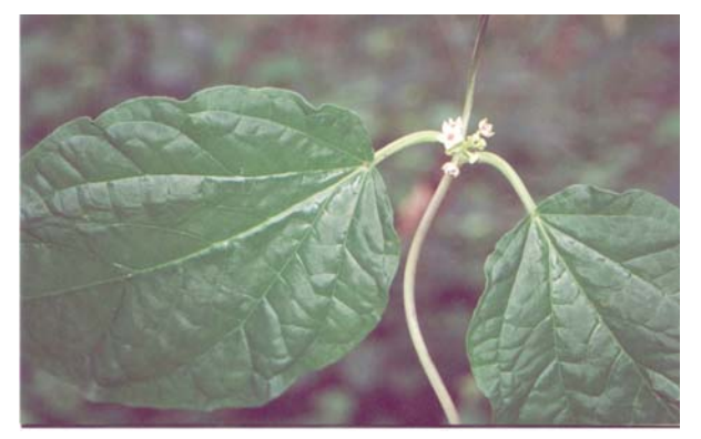
Figure 1. Heterostemma deccanense plant.

Heterostemma deccanense belongs to the family Asclepiadaceae, order Gentianales, subclass Gamopetalae, Class Magnoliopsida (Dicotyledonae) is a wiry climber species, endemic to Tropical moist mixed deciduous forests of Peninsular India (Figure 1).