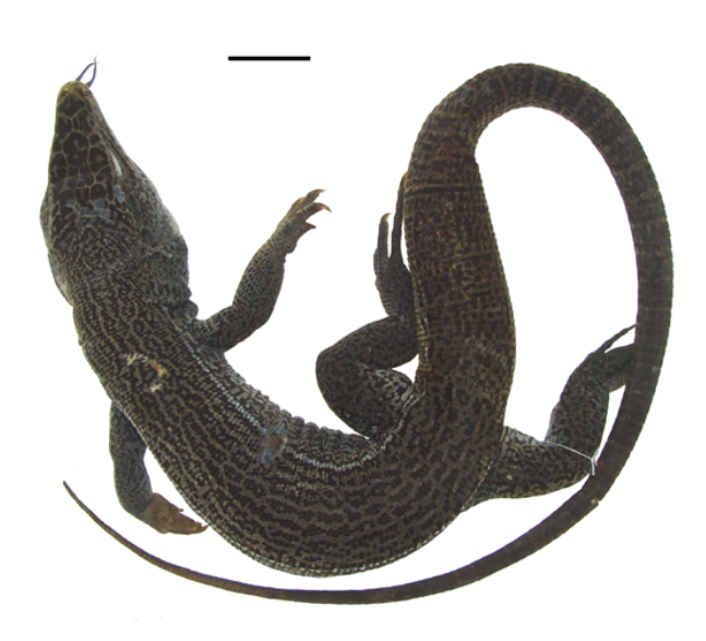
Figure 2. Adult specimen of Tupinambis quadrilineatus collected in João Pinheiro, Minas Gerais (MNRJ 17217). Scale bar: 3 cm.

During a survey of reptile fauna in the Vale dos Buritis farm, municipality of João Pinheiro, Minas Gerais (17°46'50.12" S, 46°09'39.68" W, 786 m elevation), two specimens of Tupinambis quadrilineatus were collected.