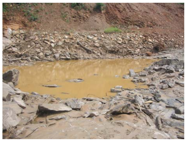
Figure 3. A remaining pool of coffer dam in Rio São Marcos, where specimens of Porotergus ellisi were collected.

Porotergus ellisi (Figure 4) is morphologically similar to Apteronotus brasiliensis, both presenting brown body without mid-dorsal clear stripe and moderately elongated snout. This suggests the possibility that other specimens of P. ellisi had already been collected in other sites of upper Rio Paraná basin and misidentified as A. brasiliensis.