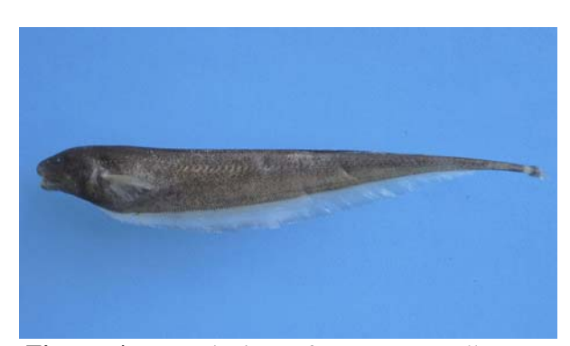
Figure 4. Lateral view of Porotergus ellisi , 148 mm of length to the end of anal fin.

Porotergus ellisi (Figure 4) is morphologically similar to Apteronotus brasiliensis, both presenting brown body without mid-dorsal clear stripe and moderately elongated snout. This suggests the possibility that other specimens of P. ellisi had already been collected in other sites of upper Rio Paraná basin and misidentified as A. brasiliensis.