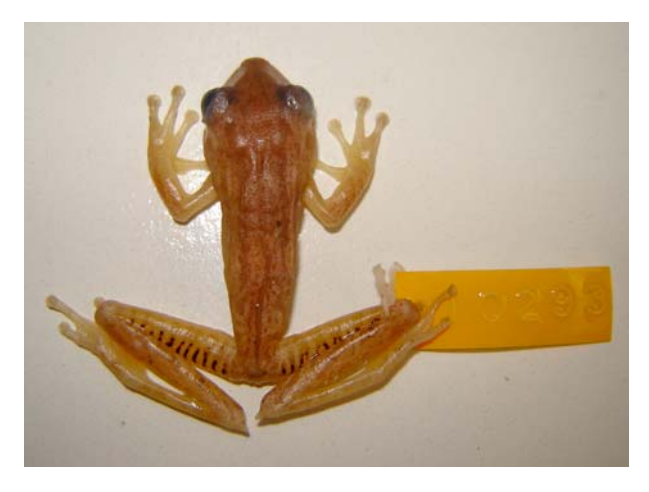
Figure 5. Hypsiboas secedens, young individual collected at Reserva Ecológica de Guapiaçu, municipality of Cachoeiras de Macacu, Rio de Janeiro, Brazil. (ZUFRJ 10319; SVL 37,8 mm).

Two additional specimens of Hypsiboas secedens were found in the amphibian collection of the Museu Nacional do Rio de Janeiro . Specimen MNRJ 40609 was collected by R.V. Marra at REGUA in October 2004; and MNRJ 40615 by F.H. Hatano in November 2004 at Estação Ecológica Paraíso , municipality of Guapimirim (Figure 6).