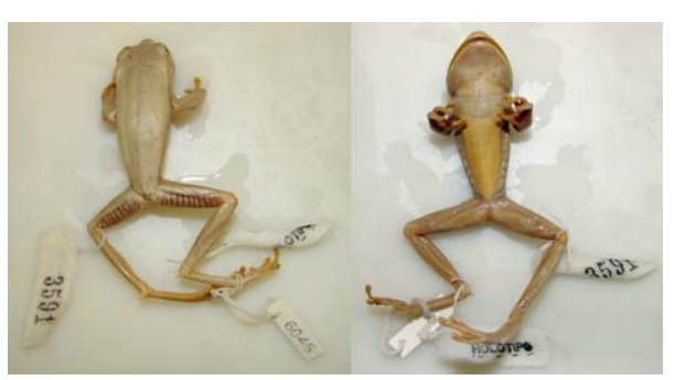
Figure 1. Hypsiboas secedens , holotype, adult male (MNRJ 3591).

Hypsiboas secedens (Lutz, 1963) belongs to the Hypsiboas pulchellus species group, which is presently composed of 30 species. This group was proposed by Faivovich et al. (2005) based on phylogenetic analysis using DNA morphological data. In the original publication (Lutz 1963), the type locality of Hypsiboas secedens was given as Barro Branco, in the state of Rio de Janeiro (ca. 22°23' S, 43°15' W) yet, the holotype (Figure 1) and 29 paratypes were bought from a commercial collector (A. Passarelli) whose indications of collecting localities were generally accurate. The species was recorded at Reserva Ecológica de Sooretama (former Parque de Sooretama), municipality of Linhares, Espírito Santo by Bokermann (1966a) (Figure 2).