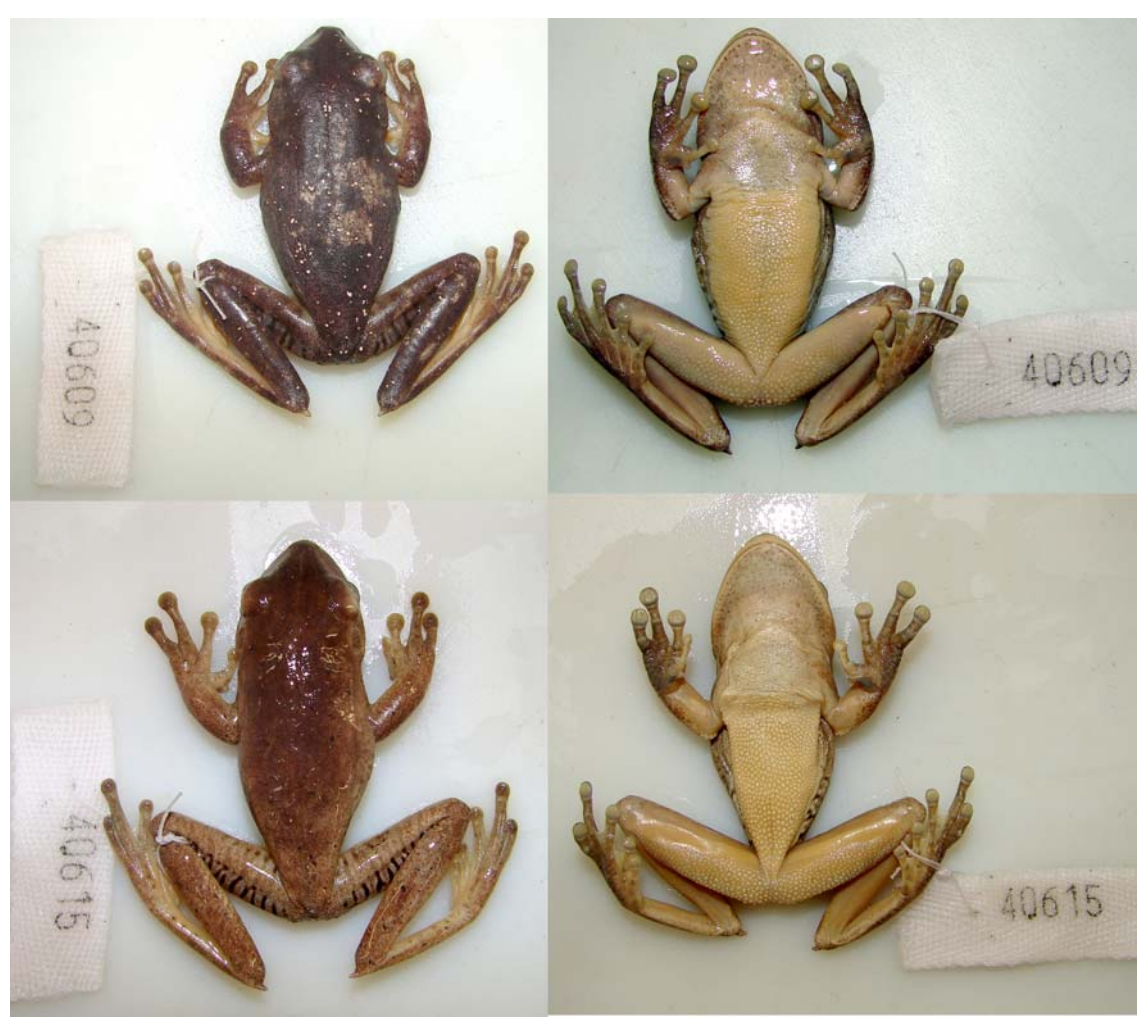
Figure 6. Adult males of Hypsiboas secedens deposited at the MNRJ Amphibian Collection. (MNRJ 40609; SVL 53,6 mm and MNRJ 40615; 55,1 mm)