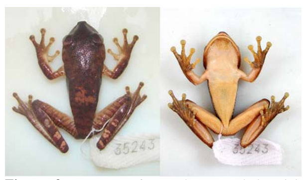
Figure 3. Paratype of Hypsiboas pombali , adult male collected at Parque Estadual Serra do Canduru , municipality of Itacaré, Bahia, Brazil. (MNRJ 35243).

Caramaschi et al. (2004) pointed out that the specimen referred by Bokermann (1966a) as H. secedens is in fact Hypsiboas pombali (Caramaschi et al. 2004) (Figure 3). Thus, considering that the specimen from Linhares, Espírito Santo is actually Hypsiboas pombali , the record of H. secedens from the state of Espírito Santo should be eliminated, decreasing the distribution range of the species to Barro Branco, municipality of Duque de Caxias, state of Rio de Janeiro.