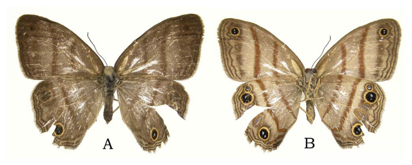
Figure 1. Female C. terrestris collected during the study (forewing length 16,48 mm). a) Dorsal; b) Ventral

The individual was collected on February 5 of 2005 in a canopy trap and was determined by using DeVries (1987). It is housed in the National Institute of Biodiversity (INBio) collection